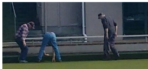
Installing the artificial grass in the ditches.