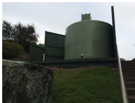
Both tanks are in use now.