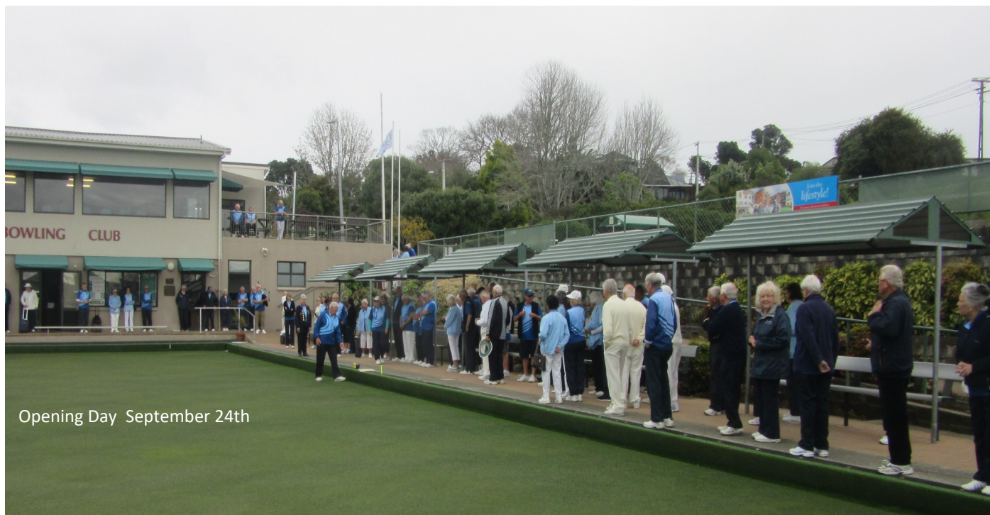
Opening Day September 24th