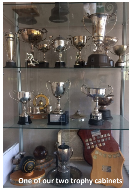
One of our two trophy cabinets