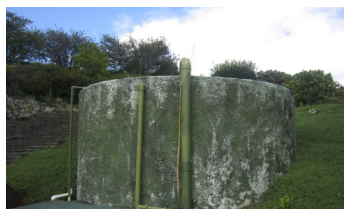
The old Tank will still be used.