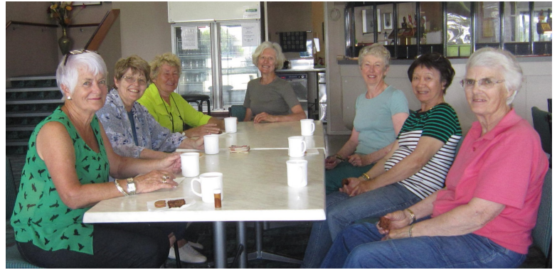
Thanks to the ladies who twice a year help with a big library sort out. The main change now is the LARGE PRINT book section is on the left side. Near C & D .