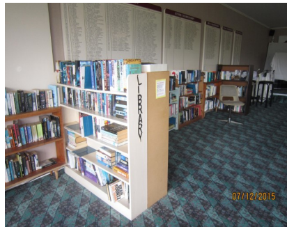
Remember, no rules, borrow books, write the date in the front and return to the table, don't put them back on the shelves.