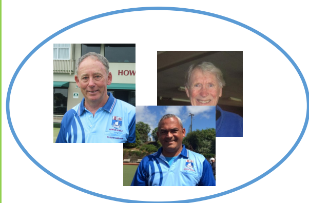
Men's Triples Finalists

It proved to be a perfect weekend for bowls with fine warm condition with a "fairly" light breeze – we can all look forward to the final in March.